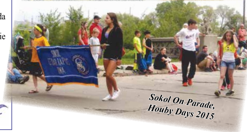
Sokol On Parade, Houby Days 2015